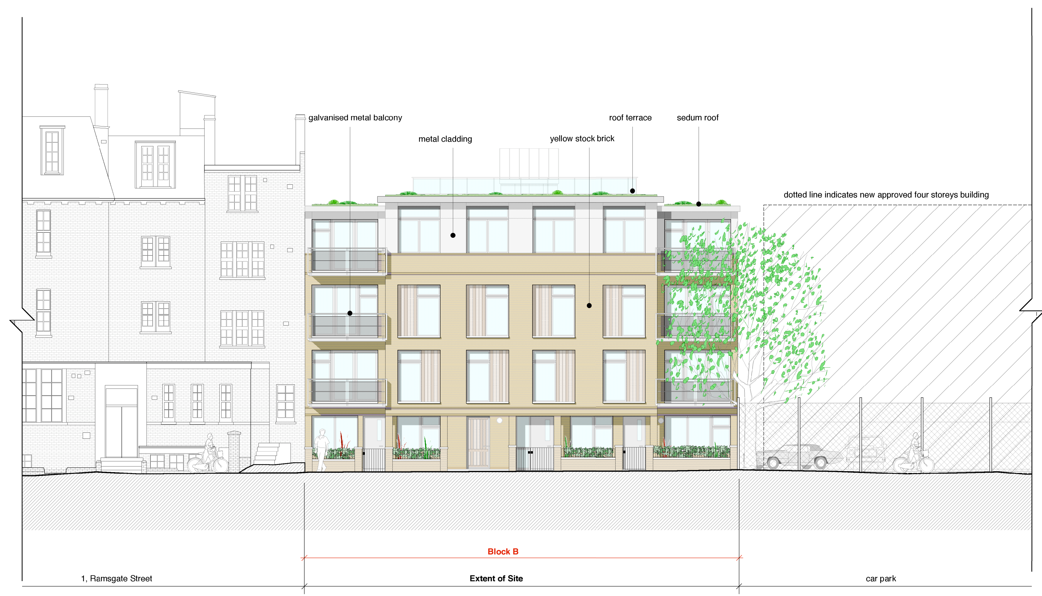
Proposed East Elevation (B-B')