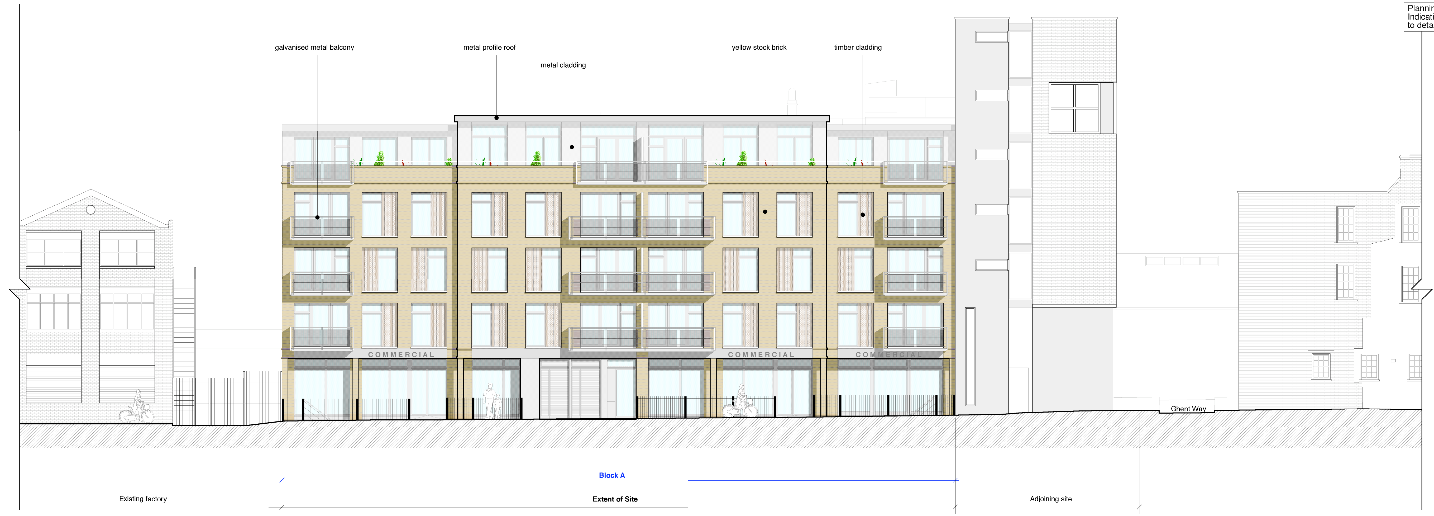
Proposed West Elevation (A-A')